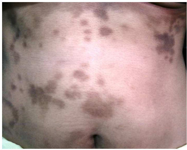
Figure 1: Multiple, discrete as well as confluent, round to oval, hyperpigmented patches over abdomen

having any other medical illness and was not on any medications. Physical examination was otherwise normal.